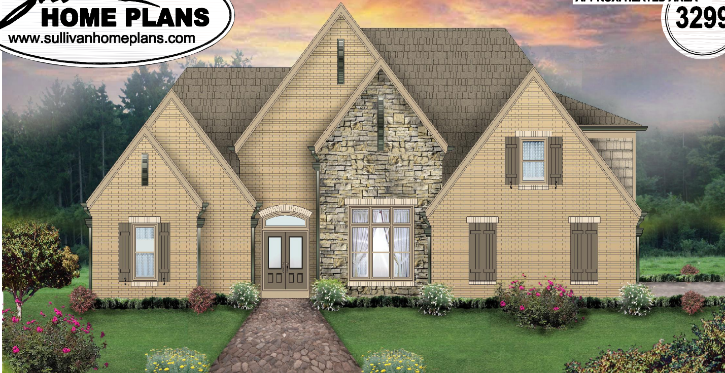
Photo or Rendering May Reflect Changes Made in Field.

9'-0" CEILINGS DOWN 8'-0" CEILINGS UP EXCEPT WHERE NOTED OTHERWISE ON PLAN