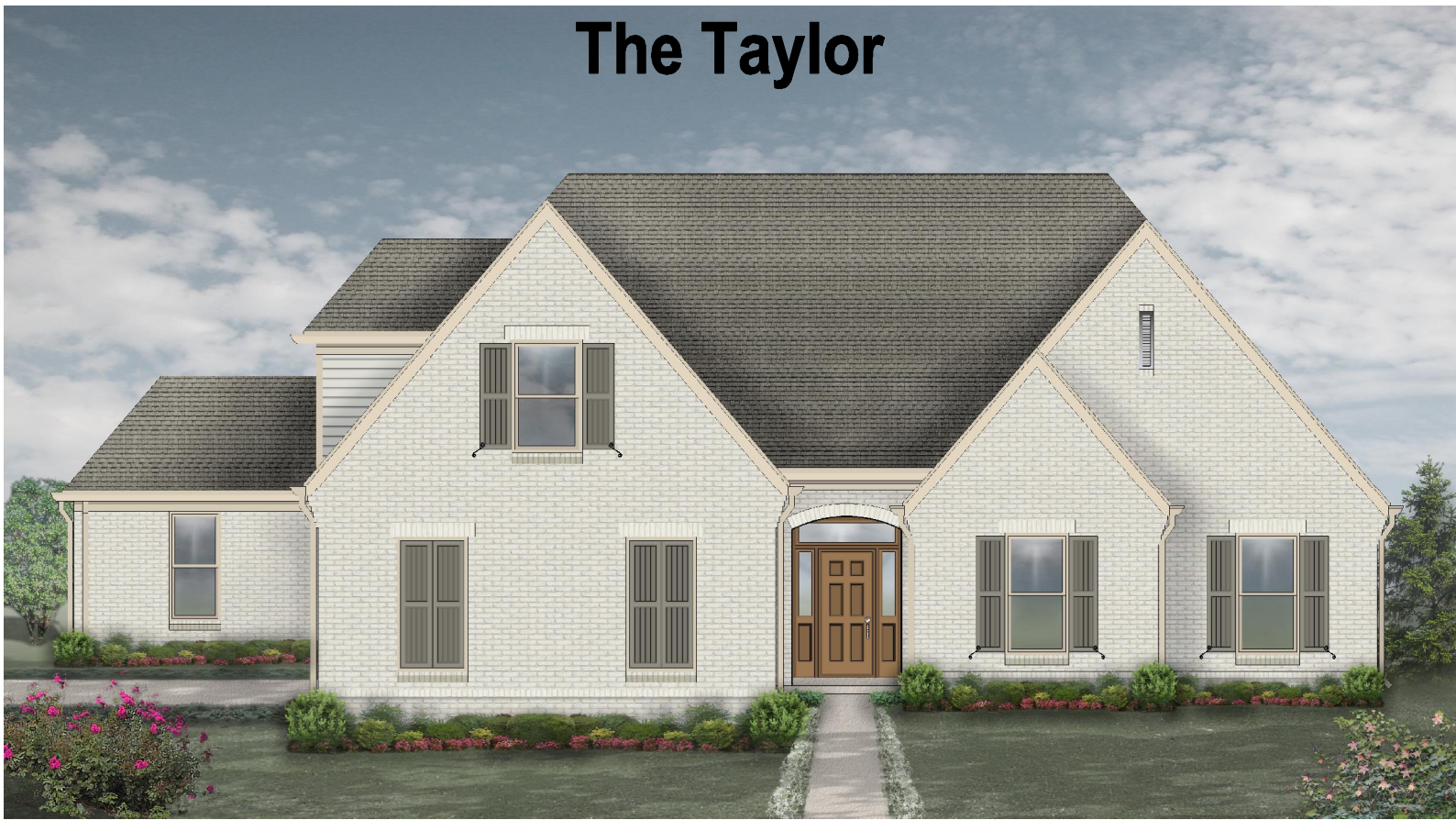
Photo or Rendering May Reflect Changes Made in Field.

9'-0" CEILINGS DOWN 8'-0" CEILINGS UP EXCEPT WHERE NOTED OTHERWISE ON PLAN