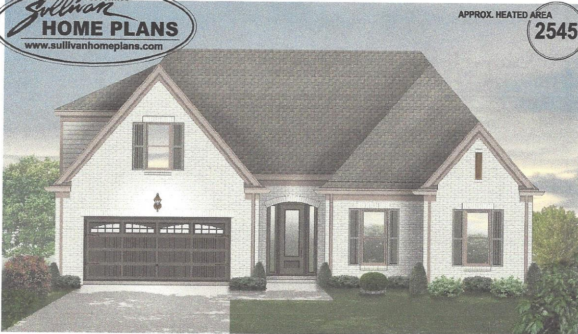
Photo or Rendering May Reflect Changes Made in Field.